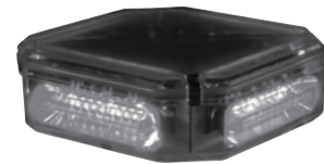
NFPA Upper Zone C