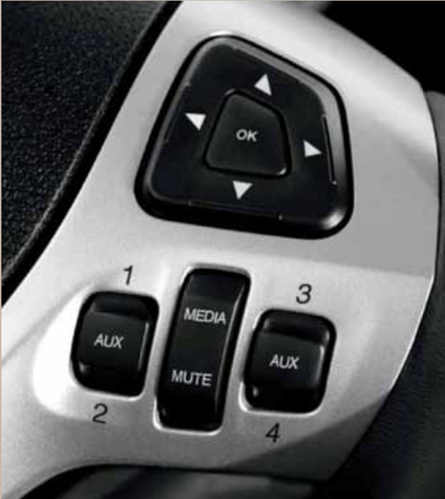
Ford P.I. Steering Wheel Remappable Switches