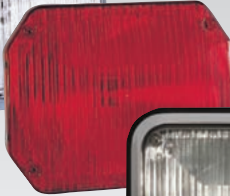
80R 9" X 7"