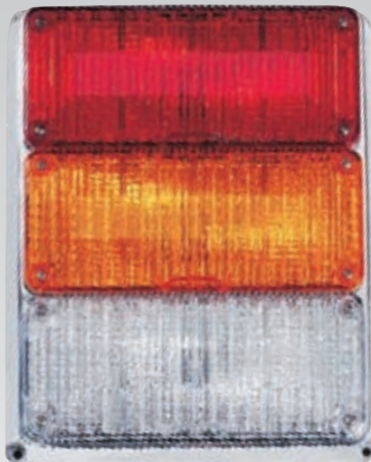
41PKG 7" X 3" TRIPLE STACK S/T/T