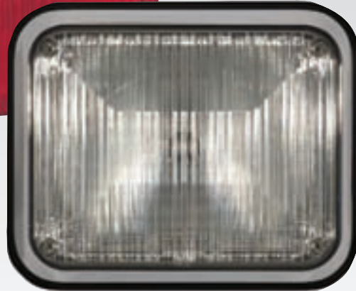
88Z26 9" X 7"